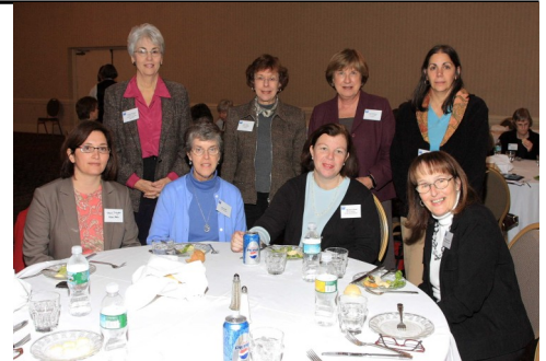
League members enjoying the day at Fall conference at the Crowne Plaza Marriot in Worcester,

The Lt. Governor responded “There’s no plan right now either way. We’ve had the great debate on that issue,” Lt. Governor