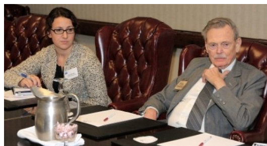
Lobbying Workshop participants