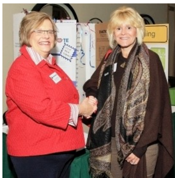
League members making new friends!