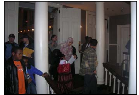
Newly naturalized citizen leaves Faneuil Hall with Citizen Ed packet

pledge of allegiance. Military soldiers who are being naturalized are recognized, there is usually at least one or two at each ceremony.