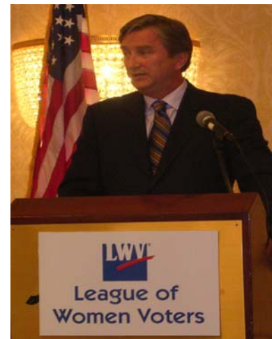
Congressman John Tierney

It was suggested that a dialogue about these fiscal issues and the complexity of the solutions needs to include the public, elected officials at all levels as well as non-governmental groups. The economic future of Massachusetts may be in the balance.