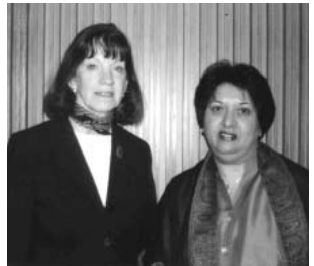
Senator Therese Murray and LWVM President Madhu Sridhar

Registration fee (includes lunch): $48.00, check or credit (MC, VISA, AMEX) Registration deadline May 5, 2004 – Call your local League President, visit www.lwvma.org , or call 617-523-2999 to register and sign up for workshops.