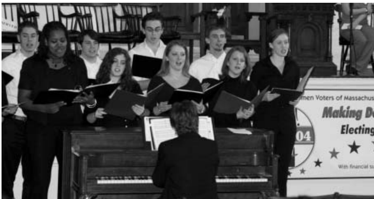
Emerson College Select Chorus performing at LWVM Awards Ceremony at Faneuil Hall, Boston.

The League of Women Voters' 5th annual Online Student Essay Contest culminated in an exhilarating and uplifting event. How exciting to listen to the next generation of leaders and voters. Share our pride: photos from the Making Democracy Work event and excerpts from some of the winning essays follow: