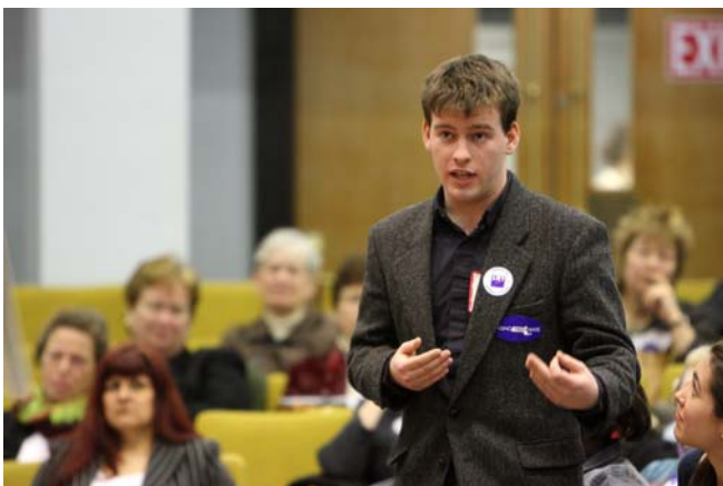
An Andover High School student asks a question