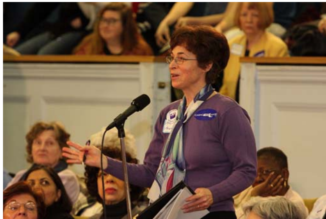
League members respond to remarks with questions of their own