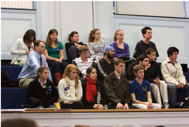
Arlington students listen intently to the speakers