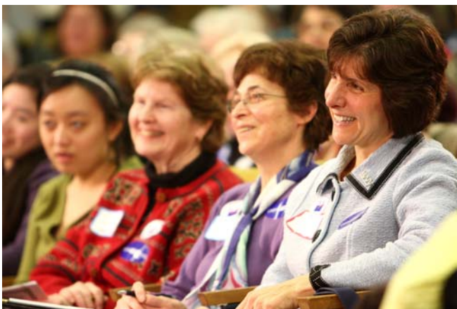
LWV Andover/N.Andover members and students