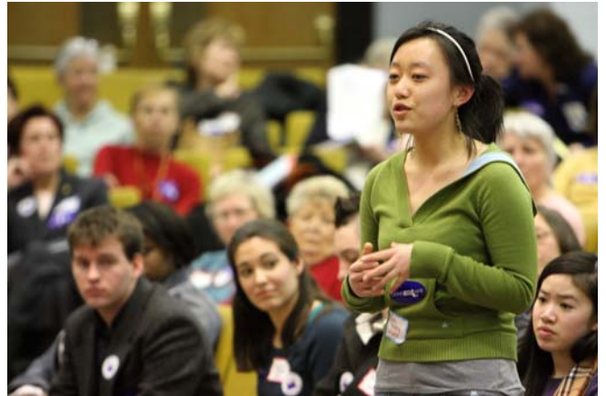
Andover High School student poses a question